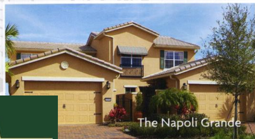
The Napoli Grande

A two-story floor plan that lives like a one-story with three bedrooms, two and a half baths, great room, loft, office/hobby room, den/media room, one-car garage with golf cart bay